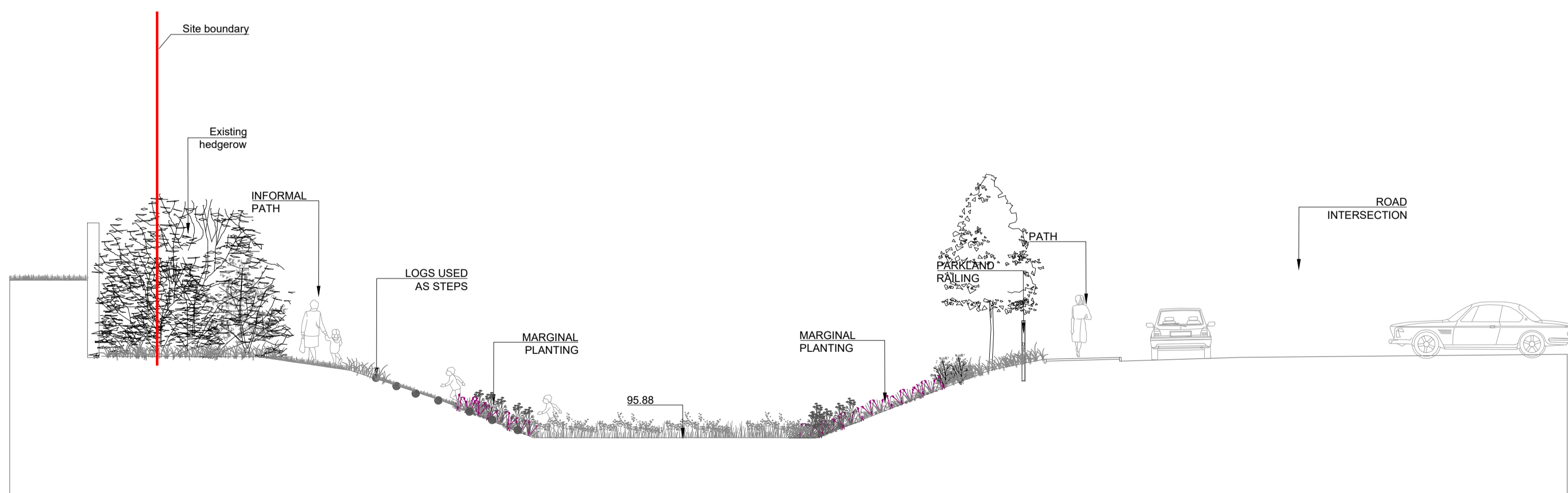
Section FF - 1/100 @A1